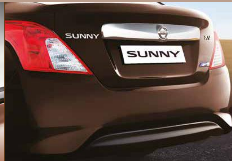
Rear Trunk Chrome Garnish and New Rear Bumper Shape