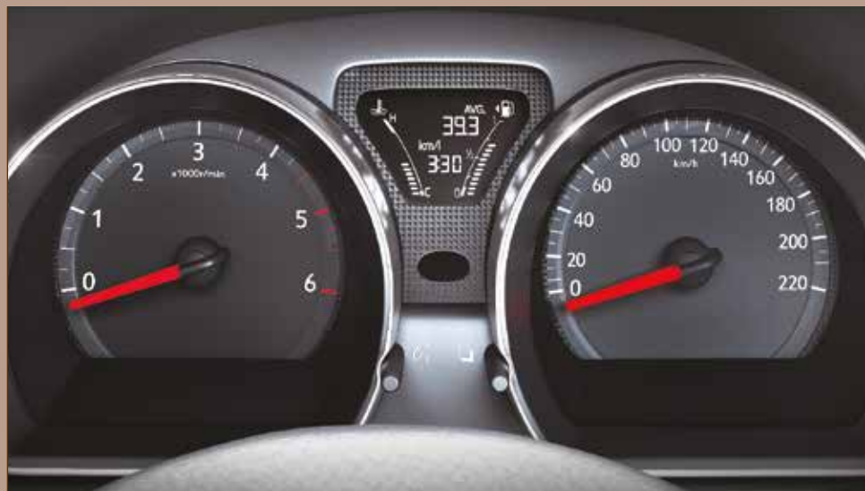
Fine Vision Metre and Drive Computer