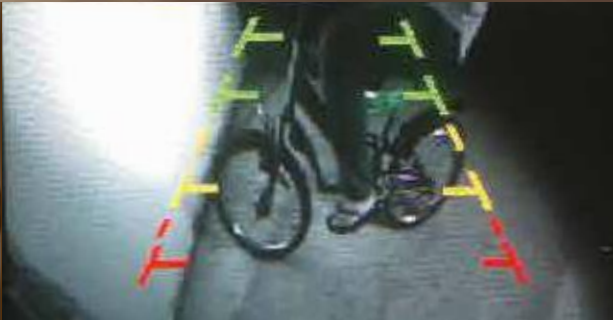
Rear View Camera with Park Assist