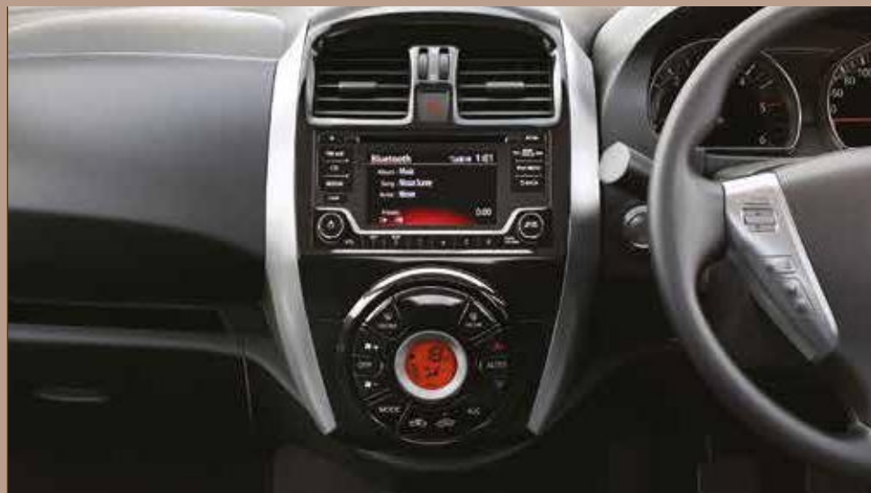
Piano Black Finish Instrument Cluster