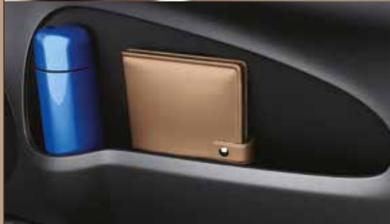
Door Bottle Holders