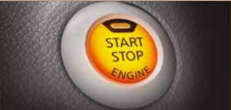
Push Button Start