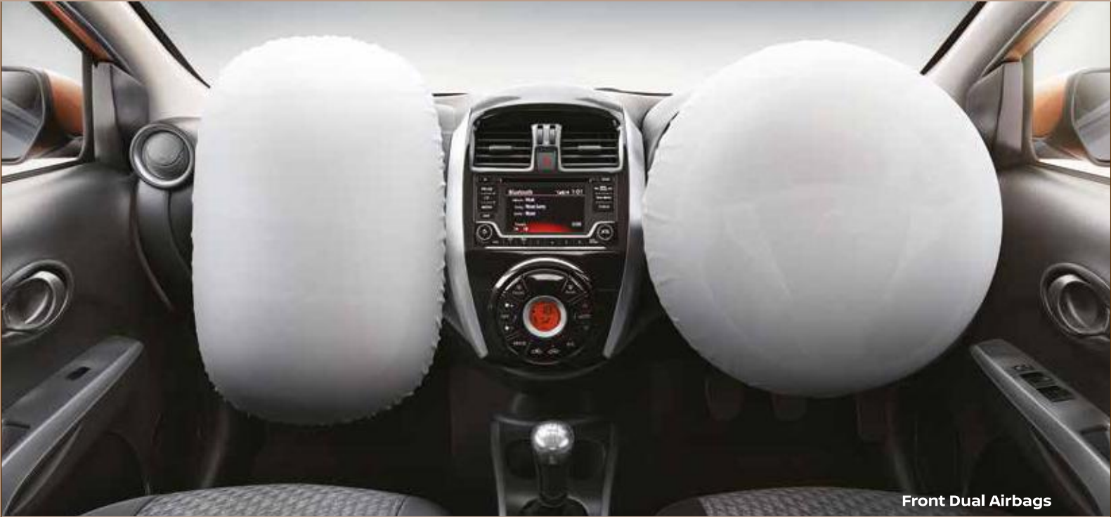
Front Dual Airbags