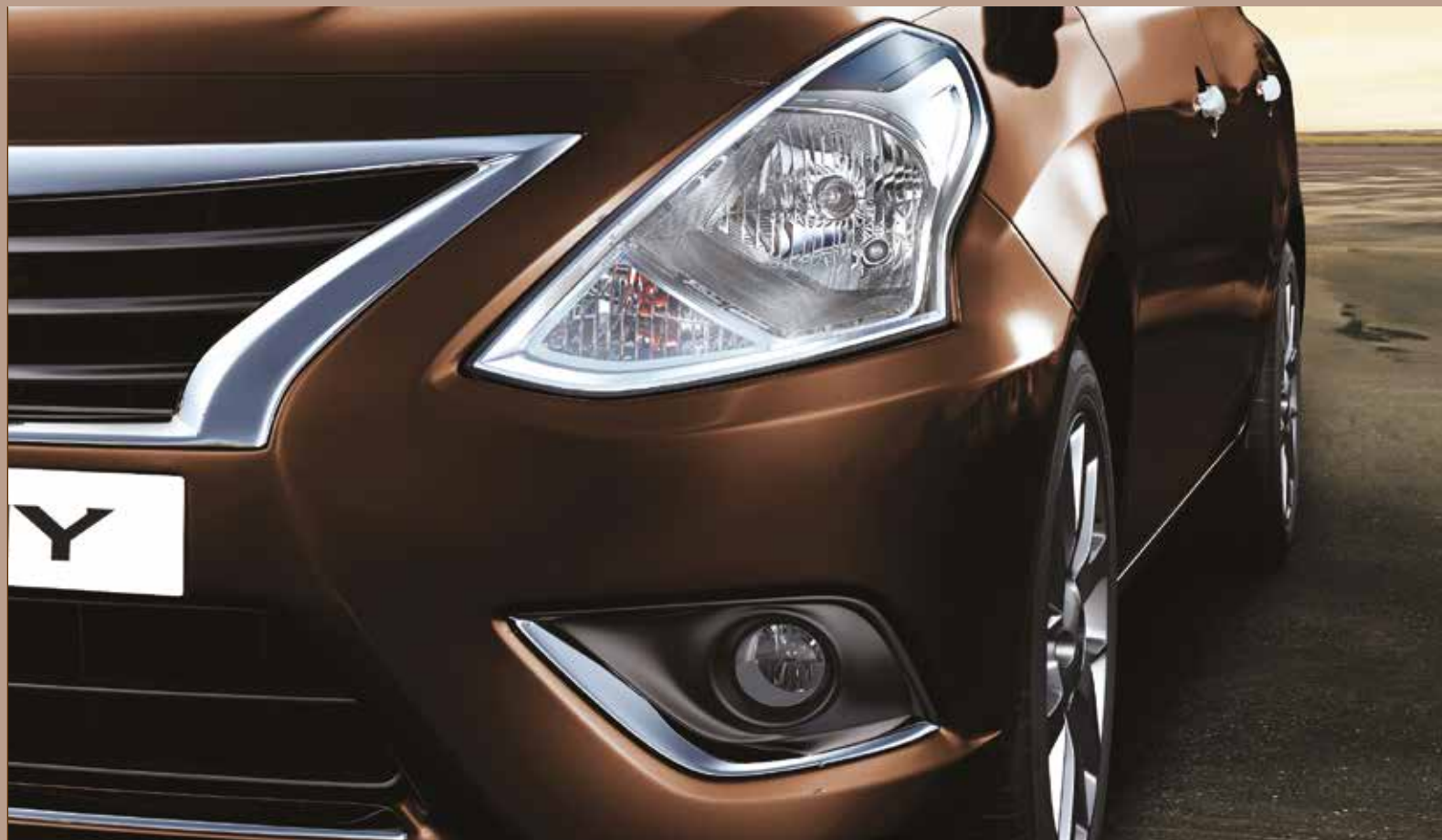
Boomerang Headlamps and Chrome Highlighted Fog Lamps