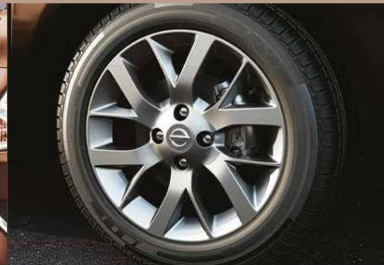
R15 12 Spoke Alloy Wheels