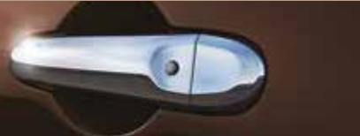
Intelligent Entry System