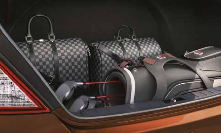
490 (l) Boot Space