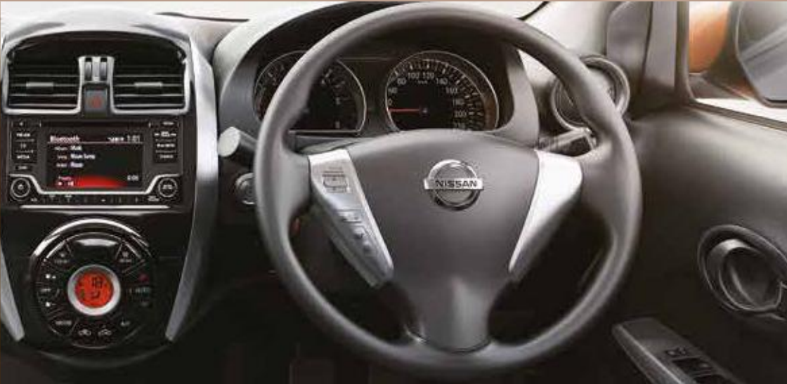
Steering Mounted Audio Controls and Handsfree Phone