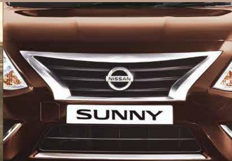
Chrome Plating Radiator Grille