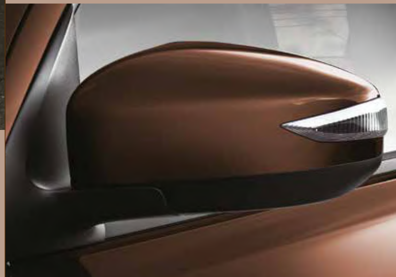
Foldable, Electrically Adjustable ORVM with Side Indicators

Aerodynamically designed, the new Nissan Sunny speaks volumes. From the bold Chrome Grille for that unforgettable frame and the Nissan Bagde to the redesigned Boomerang Headlamps for that stylish and modern touch. The chiselled front and sides complement the sleek roof while the Y-spoke design of the R15 alloy wheels add to the new Nissan Sunny's commanding presence.