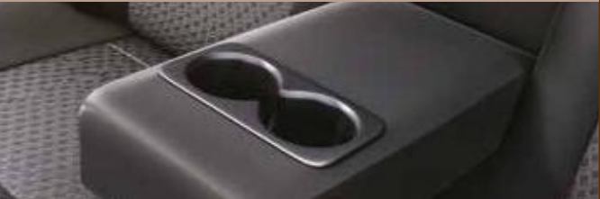
Rear Seat Centre Arm Rest